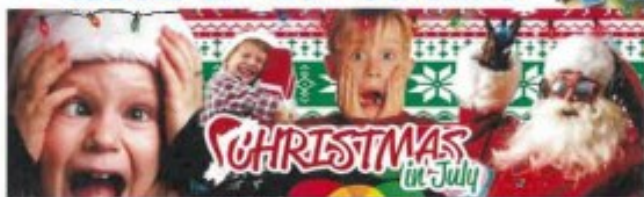
MON 26 JUN | CHRISTMAS IN JULY $75