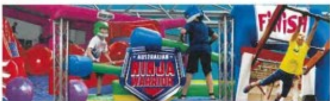
WED 28 JUN | NINJA WARRIOR $75

Bounce into this incredible BIG trampoline play centre! Learn a new trick or bounce with a friend until you can't bounce anymore! There's so much fun to be had on this epic day, so jump on in!