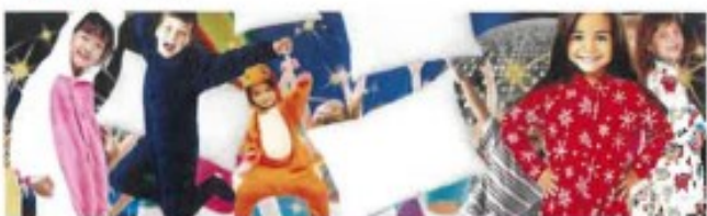
FRI 07 JUL | PJ DJ PARTY $75

Join us on this double fun day out! That's right, we're doing two activities in one trip! So warm up your bowling arms and get your shooting eye at the ready, as this day is one not to be missed!