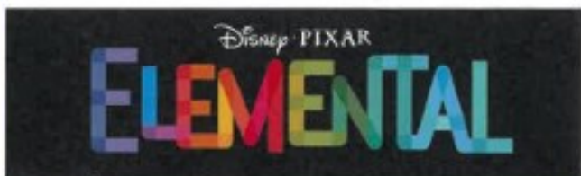
TUE 04 JUL | MOVIES: ELEMENTAL $75 + $35

Join us for this super incursion for an extraordinary and unique experience using lego bricks. Blockers is an EDUtainment program for children of all ages, so come along and become a master builder!