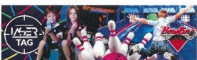
THU 06 JUL | BOWLING & LASER TAG $75 + $40

We are getting out everything crafty! Get messy with paint or sculpt a sculpture, young creative minds are always what makes an CRAFT EXPLOSION day. We can't wait to see what masterpieces are made!