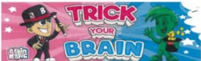
THU 29 JUN | TRICK YOUR BRAIN $75 + $25

Ninjas assemble! Today you will have the chance to graduate from our Big Ninja Academy. From creating costumes and crafts, to braving the Ninja warrior course, by the end of the day you will become a true ninja sensei!