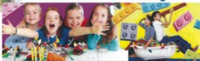
MON 03 JUL | BLOCKERS $75 + $25