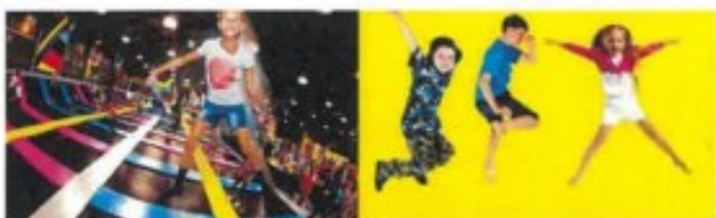
TUE 27 JUN | FLIP OUT $75 + $30

We can't wait till the end of the year until Xmas! So today we will be doing all things Xmas-y! Make and wrap presents, bake Christmas cookies and sing the carols to get us into the true Xmas spirit!