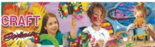
WED 05 JUL | CRAFT EXPLOSION $75

Today we're off to the movies to watch Disney Pixar's latest flick 'Elemental' In a city where fire, water, land, and air characters live together, they discover something elemental: how much they really have in common.