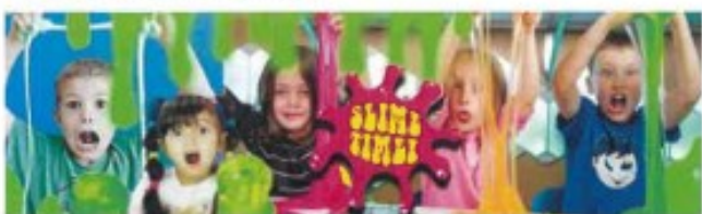
FRI 30 JUN | SLIME TIME $75